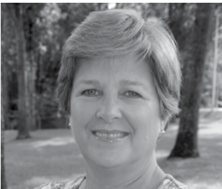
Our College Family .....8-9