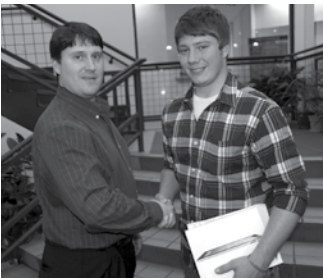
College Goal SC..... 4