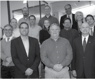
Highway Construction Materials Lab..... 3